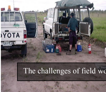
The challenges of field work