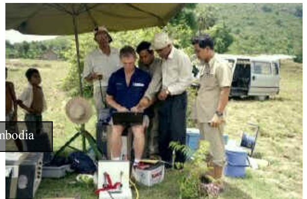
Training Counterpart staff in Cambodia